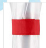
Coloured closing strap