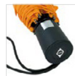
Soft-Touch handle with silver push-button and promotional labelling option